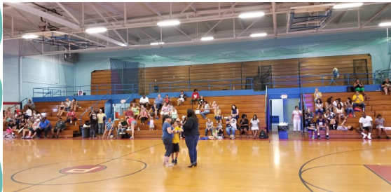
Community Forum members gather in the Portsmouth High School Gymnasium

Several community members spoke about their personal stories of suicide attempts and losses of friends and family members. There was also extensive discussion on dispelling the stigma around suicide and talking openly about warning signs and prevention strategies. Local counseling centers were on hand to provide linkage to the services. Attendees also received information on the Crisis Text Line and the National Suicide Prevention Lifeline, as well as other materials provided by OSPF.